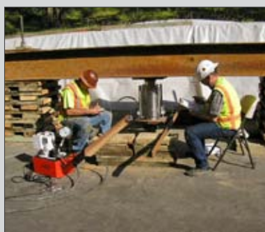
Micropile load testing

The lineage of Rose Bowl Stadium can be traced back to January 1, 1890, when the Valley Hunt Club in Pasadena staged a parade of flower-decorated horse and buggies and public games including foot races, tugs of war, and a jousting tourney of rings. An audience of 2,000 watched the event, which was dubbed the Tournament of Roses. The site was called Tournament Park and it was home to annual college football games, chariot races, ostrich races, and even an elephant-camel race. By 1920 the facilities at Tournament Park were deemed unsafe to host the growing number of attendees on New Year's Day and so in 1921, the horseshoe-shaped Rose Bowl stadium was built on 10 acres of land previously purchased by the City of Pasadena. The new stadium had a seating capacity of 57,000 and was designed by Myron Hunt. Besides the New Year's Day football games, the Rose Bowl has hosted other major events through the years: the cycling events during the 1932 Summer Olympics in Los Angeles; the soccer competition during the XXIII Olympiad in Los Angeles in 1984; six Super Bowls; the 1994 Men's World Cup soccer games; and the 1999 Women's World Cup soccer games. During the three-year construction time table for the renovations and improvements, the stadium will continue to host football games and other events. ■