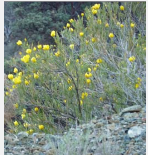
Mariposa growing on serpentine outcrops on Figueroa Mountain, CA

recommended. In 1965, California designated serpentine as its state rock. Legislation is pending to remove it from this status because of the asbestos-related health concerns. But it turns out that serpentine has potential health and environmental benefits. It has the ability to chemically fix carbon dioxide into the solid mineral magnesium carbonate, and thus it may be possible to use it to sequester carbon from greenhouse gases. Also, serpentine grasslands and outcrop areas are a haven for native plant communities. The grasslands and outcrops are formed in areas where low density serpentinite has worked its way up through weaknesses such as fault zones in the Earth's crust. The soils derived from the rock are poor in plant nutrients and rich in heavy metals, and are shallow and easily erodible. Native plants have adapted to these inhospitable conditions. In California, the Tiburon Indian Paintbrush, the Santa Clara Valley Dudleya, the Fountain Thistle, the Black Jewelflower and the Dwarf Rattlesnake Plantain grow on serpentine grasslands and outcrops, which are also host to spring wildflowers like California's orange poppies.